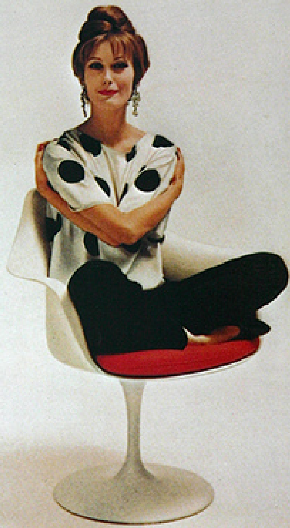
No. 128 Chair from the collection of Simple Modern Chairs and Tables. Designed by Eero Saarinen